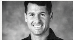
MEET COL. SHANE KIMBROUGH, ASTRONAUT

Retain your commission while being posted to a diplomatic mission, usually at an embassy in a world capital. The U.S. has deployed permanent military attachés to certain of its embassies since 1889. Today, defense attachés work under the auspices of the Defense Intelligence Agency, making them de facto intelligence officers, as well as global representatives of their branch of service. Learn more: https://www.dia.mil/Careers/Military/